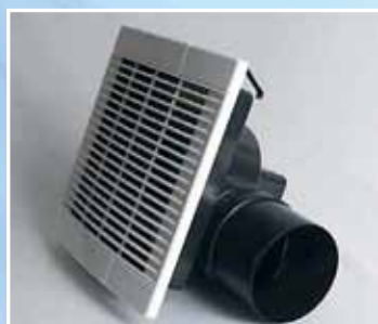
AW907 Ducted ceiling fan

J Power plug and 1m cord easy and safe installation