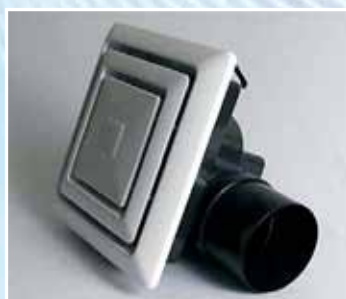
AW908 Ducted ceiling fan